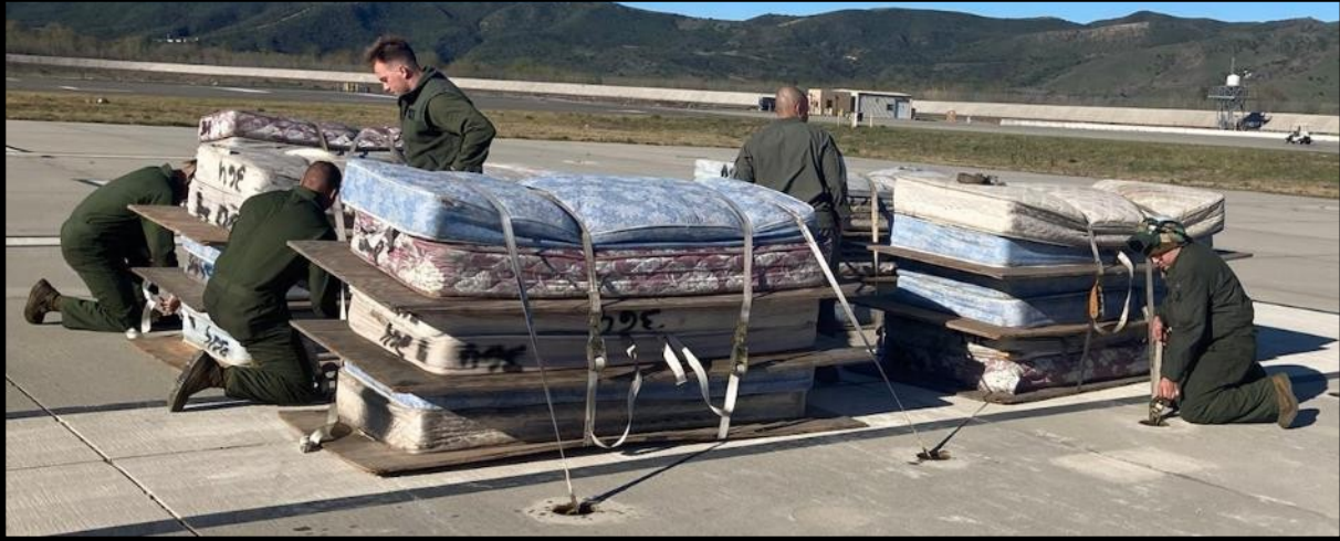
KNFG Hung Gear Drill at KNFG ELP with Purple Fox ELRT employing VMM-364 mattresses

BLUF: On 24 Feb, 2022, hung gear drill executed w/MCAS IOT validate ELP procedures in latest KNFG AOM. 25-28 Feb, 2022 Reno CCX, initial LAT/high altitude training for new aircrew, completion of Feb SBTP. 5 Feb, 2022, Purple Fox Family Readiness Team coordinated flightline family photos, recognizing the efforts of the entire Purple Fox family.