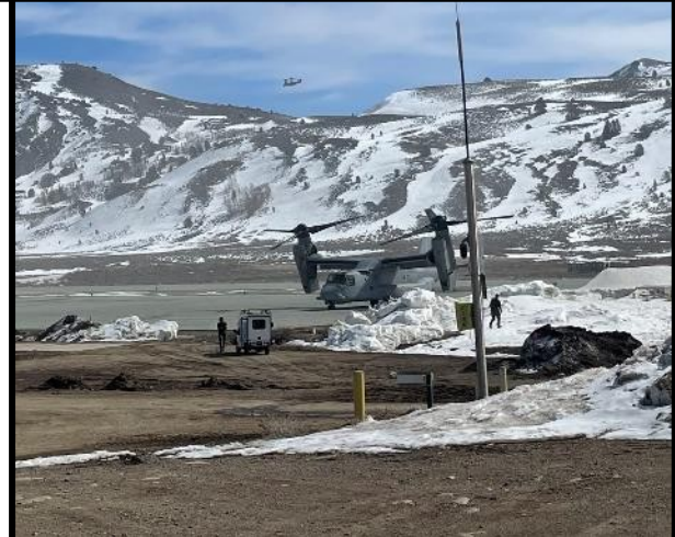
Reno / Bridgeport High Altitude / Cold WX CCX