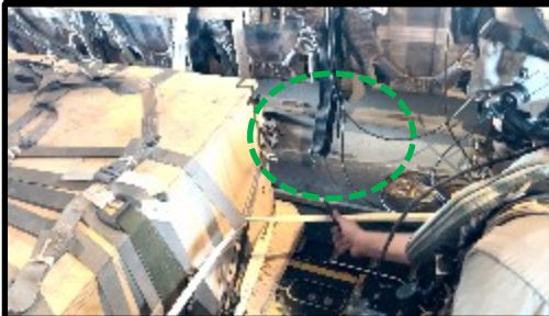
Fuel and FARP equipment being dropped by VMM-364